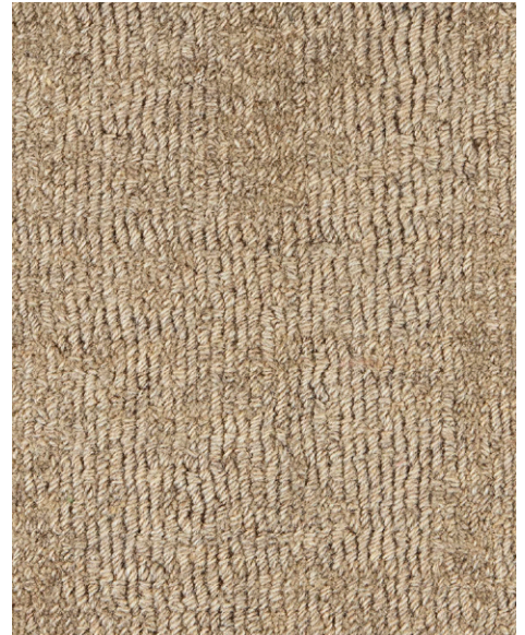
JL1333 / ABERDASH