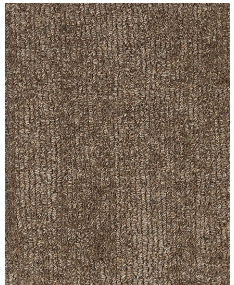
JL1335 / BOULDER GREY