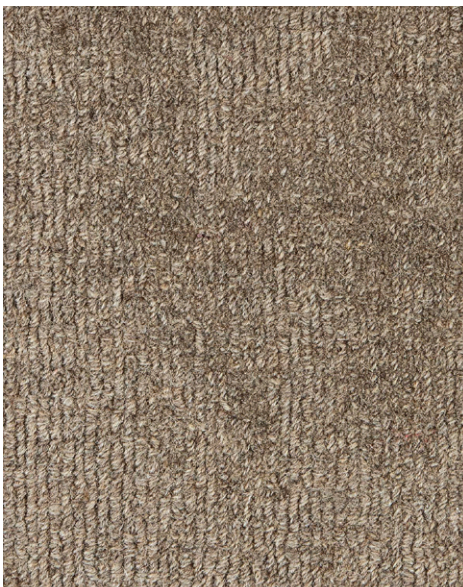
JL1334 / STONEWASH