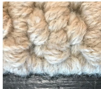
Hand Serging: Also available: • Machine serged • Machine bound