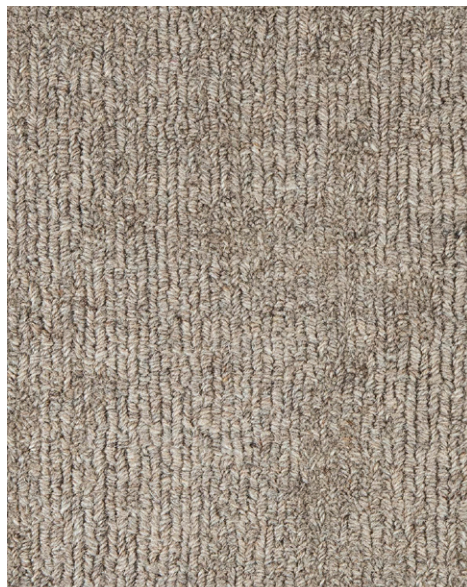
JL1331 / KOALA