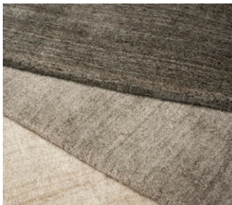
Rollled-Edge Finish *Preferred Finish