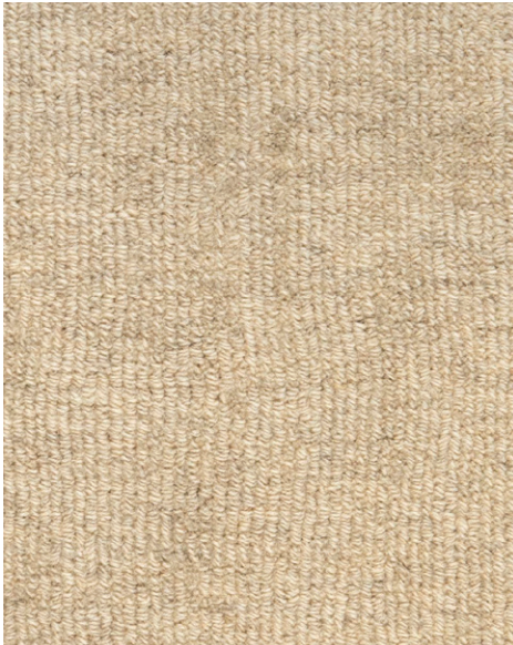
JL1332 / PIGEON

MASI UNDYED NATURAL WOOL / 15' WIDE ROLLS / HAND LOOMED