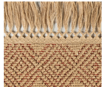
Designer Fringe: Fringe samples available upon request