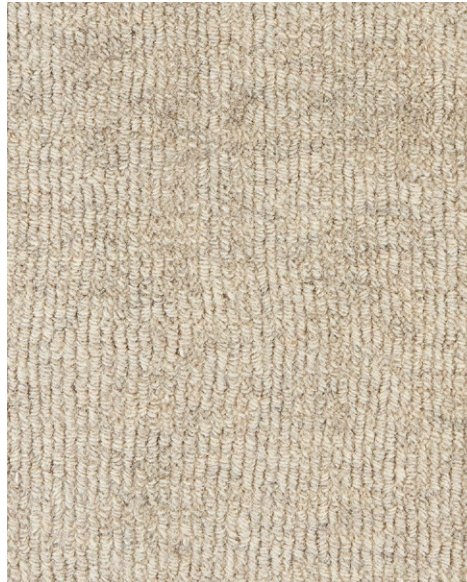
JL1336 / OYSTER